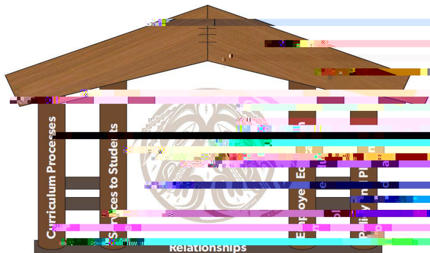
Four Corner Post-Model of Indigenization...

All four corner posts are supported by a strong foundation of relationships between and amongst the Indigenous and non-Indigenous members of the college, including students, employees and leaders, alongside our relationships with Indigenous